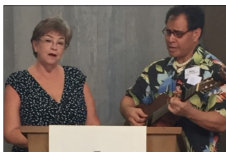
Our smiling greeters!!