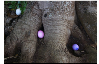
Can you find the Easter eggs?