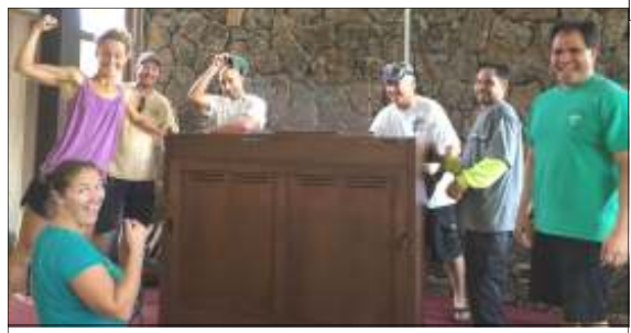
Moving the organ and baby grand piano with the parents of Keiki Co-op!