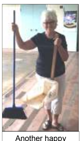
Another happy volunteer