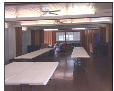
PHEW!! No trace of our rummage sale!