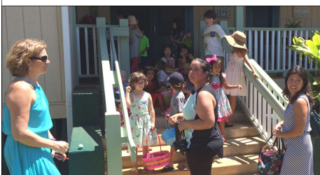
After church @ the parsonage