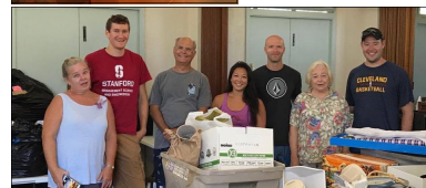
The 1st volunteer crew, even from Alaska!