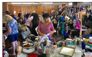
Rummage Sale shoppers