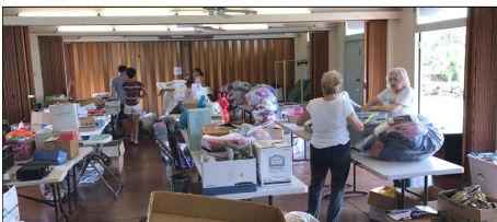
Taking down and packing up "unsold" merchandise