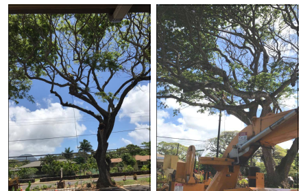
Tree trimming of church monkey pods. The tress look so happy. Can you spot the tree trimmer high in the trees???