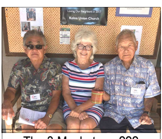
The 3 Musketeers???