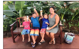
Enjoying their Lappert's "bingo prizes" gift cards!!!