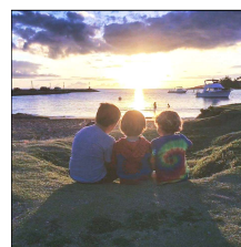
Brothers at sunset

If you were born in the Year of the dog, you have the best traits of human nature: you are honest, friendly, faithful, loyal, smart, straightforward and have a strong sense of responsibility.