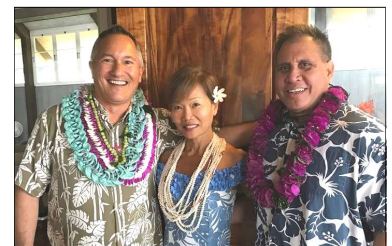
Our Kahu, our hula dancer, our "all around guy"