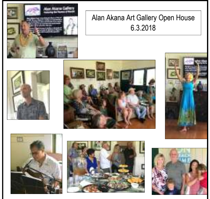
Alan Akana Art Gallery Open House 6.3.2018