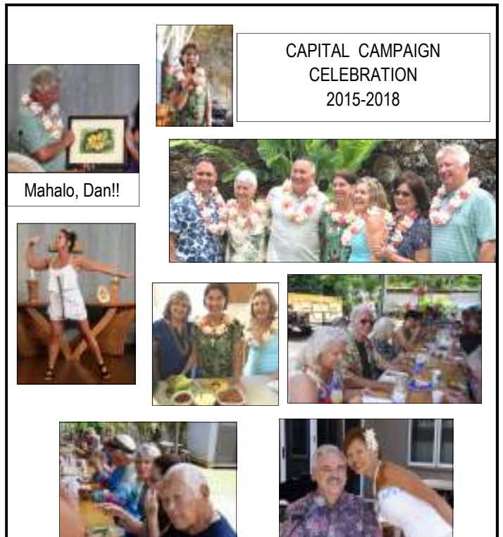
CAPITAL CAMPAIGN CELEBRATION 2015-2018